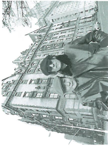
John & Yoko lived on the 7th floor facing West 72nd Street and Central Park West. Their bedroom window overlooked Central Park. Here is their apartment outlined.

John Lennon and Yoko Ono famously lived at The Dakota Building on 1 West 72nd Street New York, NY 10023. They initially sublet the apartment #72 from actor Robert Ryan and then eventually purchased it sometime after his death in 1973. Here they are standing in front of their apartment